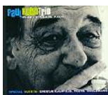
IOR CD 77040-2