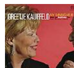
IOR CD 77052-6