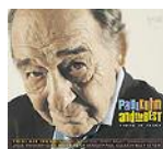
IOR CD 77046-2