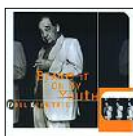
IOR CD 77042-2