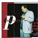
IOR CD 77044-2