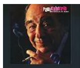
IOR CD 77038-2