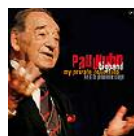
IOR CD 77058-2