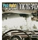
IOR CD 77048-2