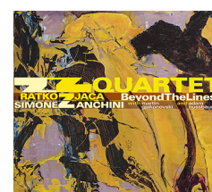
ZZ QUARTET BEYOND THE LINES IOR CD 77117-2