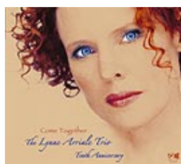
IOR CD 77069-2 Lynne Arriale Trio »Come Together«