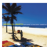
MORELLO & BARTH feat. Alaide Costa & Johnny Alf Fim De Semana Em Eldorado IOR CD 77055-2