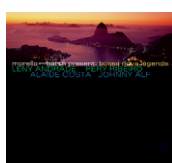
MORELLO & BARTH PRESENT BOSSA NOVA LEGENDS Leny Andrade • Pery Ribeiro • Alaide Costa • Johnny Alf IOR CD 77065-2