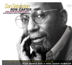
RON CARTER THE GOLDEN STRIKER TRIO AT SAN SEBASTIAN

Limited Deluxe Edition Plus DVD , Bonustracks & Free Audiosampler (Gesamtspieldauer 171 Minuten) Doppel Digipac & Booklet IOR DVD/CD 77103-9