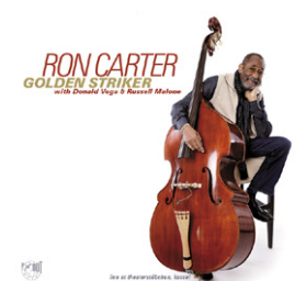
RON CARTER GOLDEN STRIKER TRIO WITH DONALD VEGA & RUSSELL MALONE LIVE AT THE THEATERSTÜBCHEN, KASSEL