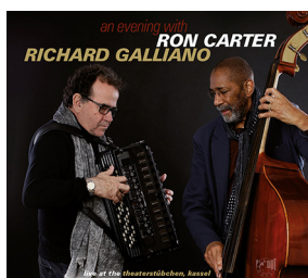
AN EVENING WITH RON CARTER & RICHARD GALLIANO LIVE AT THE THEATERSTÜBCHEN, KASSEL

Standard CD Version im Jewelcase IOR CD 77123-2