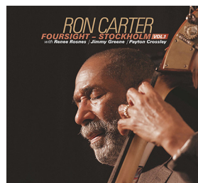
RON CARTER FOURSIGHT QUARTET STOCKHOLM VOL.1