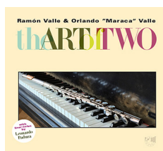
RAMÓN VALLE & ORLANDO "MARACA" VALLE THE ART OF TWO IOR CD 77131-2