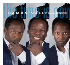
RAMÓN VALLE featuring ROY HARGROVE THE TIME IS NOW IOR CD 77137-2