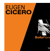
Solo Piano IOR CD 77073-2