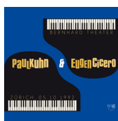
Bernhard Theater Zürich IOR CD 77090-2