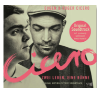
Cicero - Zwei Leben, eine Bühne IOR CD 77148-2